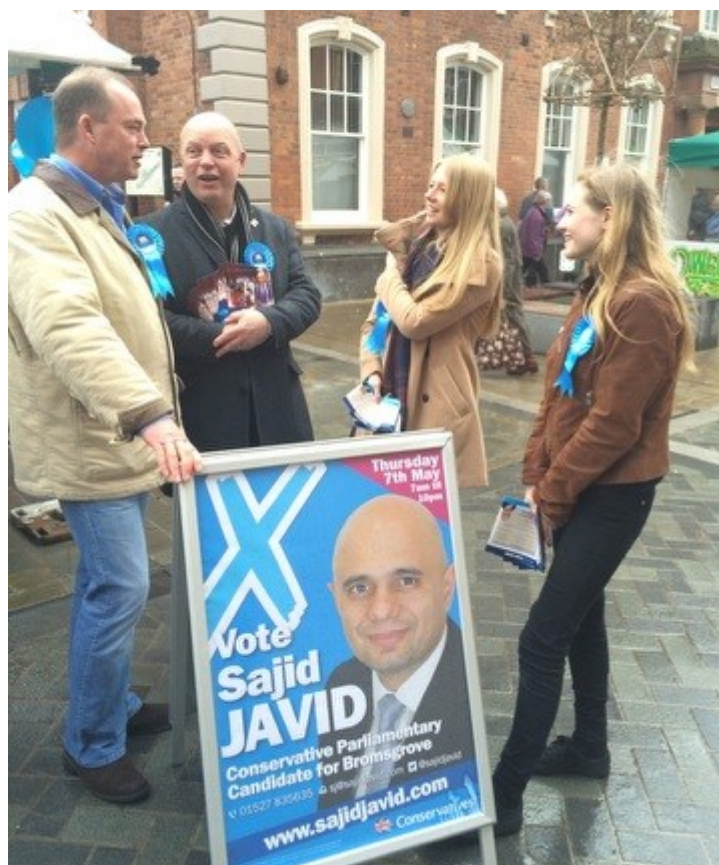
LOCAL COUNCILLORS AND ACTIVISTS AT A STREET SURGERY WITH SAJID JAVID ON BROMSGROVE'S BUSY HIGH STREET

That is why the Conservatives in Bromsgrove believe in supporting local businesses. Strong businesses mean a strong local economy.