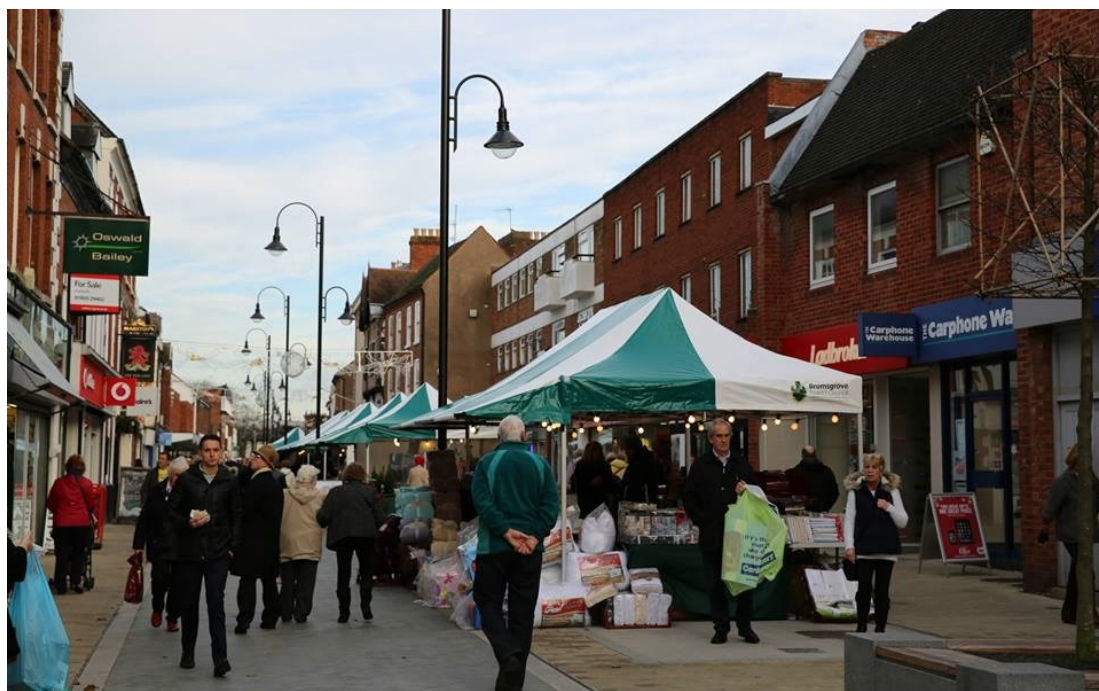
THE NEWLY REFURBISHED HIGH STREET