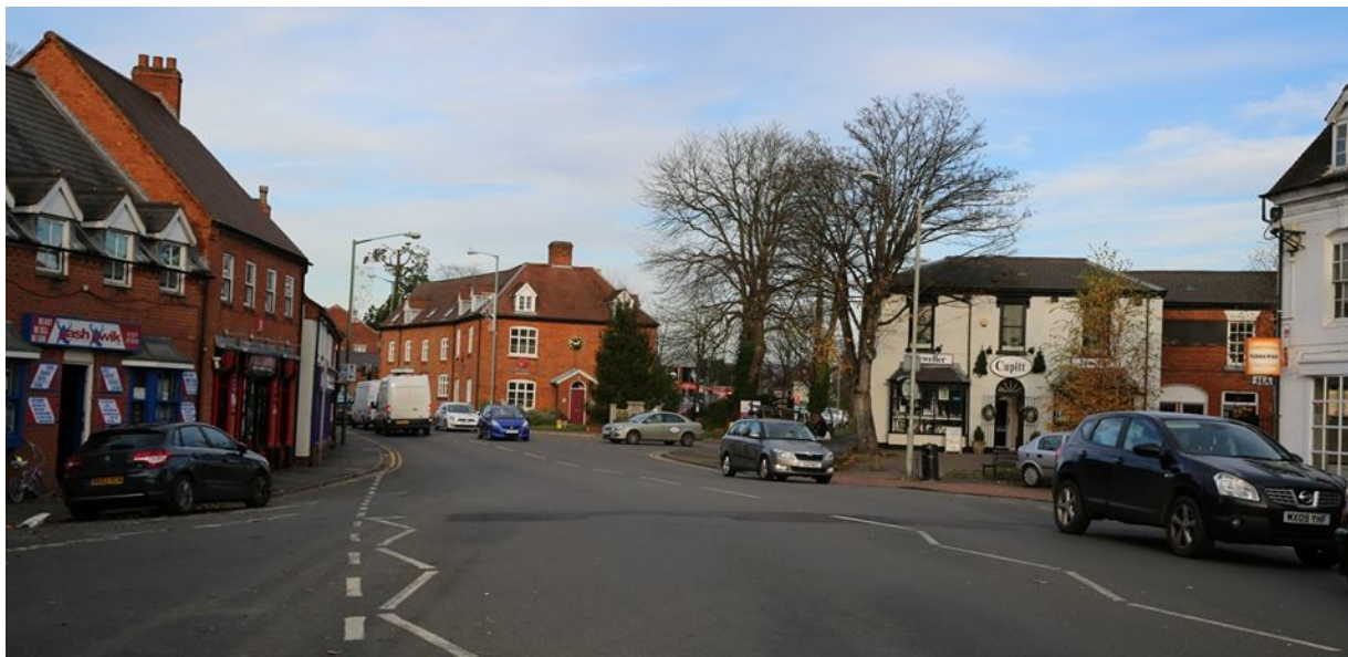
THE GATEWAY TO BROMSGROVE